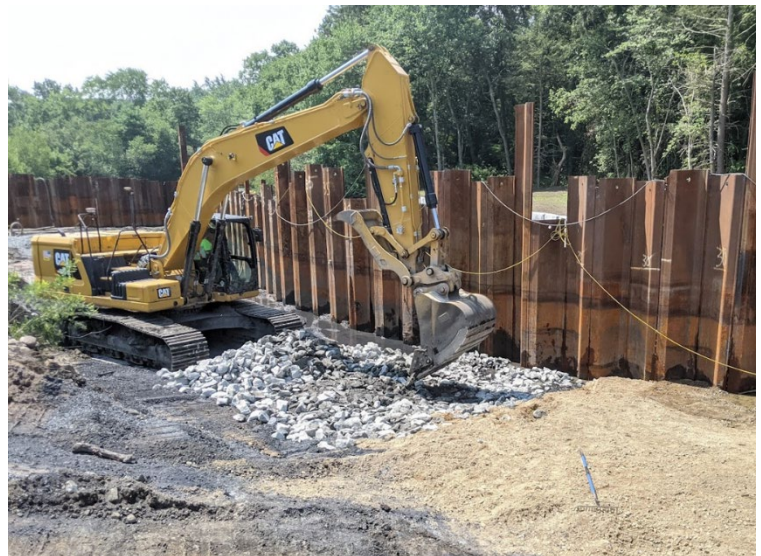
Installation of Rip Rap Layer at Area 9