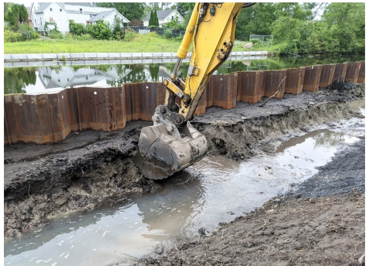
Excavation at Area 8