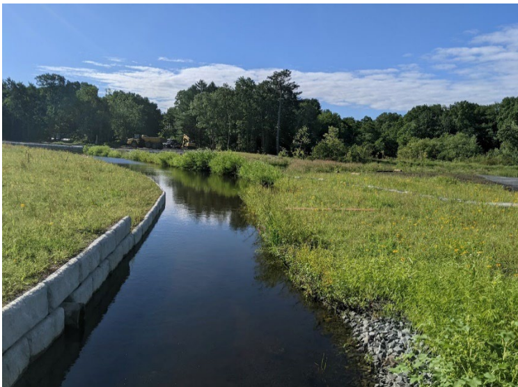
Progress of Restoration in Mire Brook